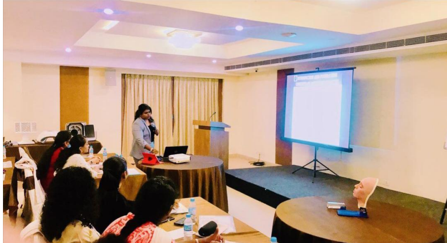
PRE CONFERENCE ON COSMETIC DENTISTRY

Phone.:7449000052 / 53 / 54 Fax : 044 -2743 5770 E-mail : info@svdentalcollege.com www.svdentalcollege.com